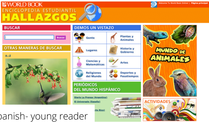
Spanish- young reader

There are many different features throughout World Book products designed to help students who are learning English. Additionally, three of our products are in a different language: