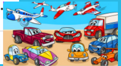
Find the Differences: Vehicles